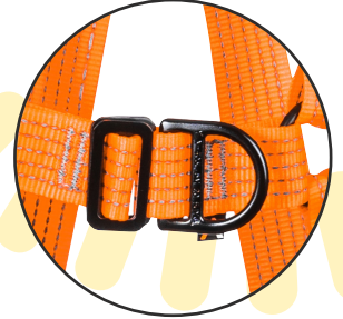
Front attachment point