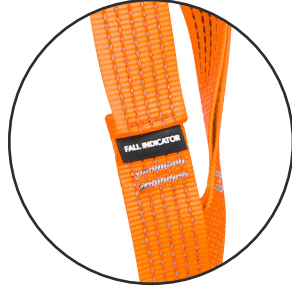
Rip stitch indicators