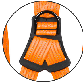
Rear attachment point